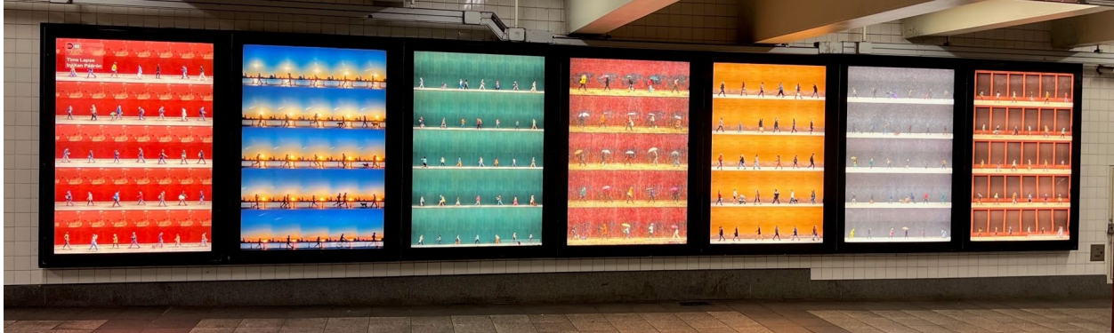
Time Lapse (2023) © Xan Padrón presented by MTA Arts & Design at NYCT 42 St-Bryant Park Station.

(NEW YORK, NY — July 10, 2023) MTA Arts & Design today announced Time Lapse , a new exhibition of photographs by artist Xan Padrón. Featuring seven large scale images from Padrón's series of the same name, the exhibition showcases Padrón signature blend of street photography and modern art sensibilities.