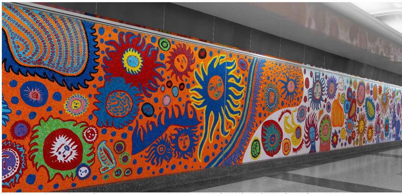
A Message of Love, Directly from My Heart unto the Universe (2022) © YAYOI KUSAMA, Grand Central Madison. Commissioned by MTA Arts & Design.

(NEW YORK, NY — November 30, 2022) MTA Arts & Design is pleased to announce a spectacular new artwork by Yayoi Kusama commissioned for Grand Central Madison, a new 700,000-square-foot Long Island Rail Road terminal below Grand Central Terminal along Madison Avenue between 43 and 48 Streets in Manhattan. Mosaic artwork by the acclaimed artist, titled A Message of Love, Directly from My Heart unto the Universe (2022), enlivens the Madison Concourse of Long Island Rail Road's new eastside terminus.