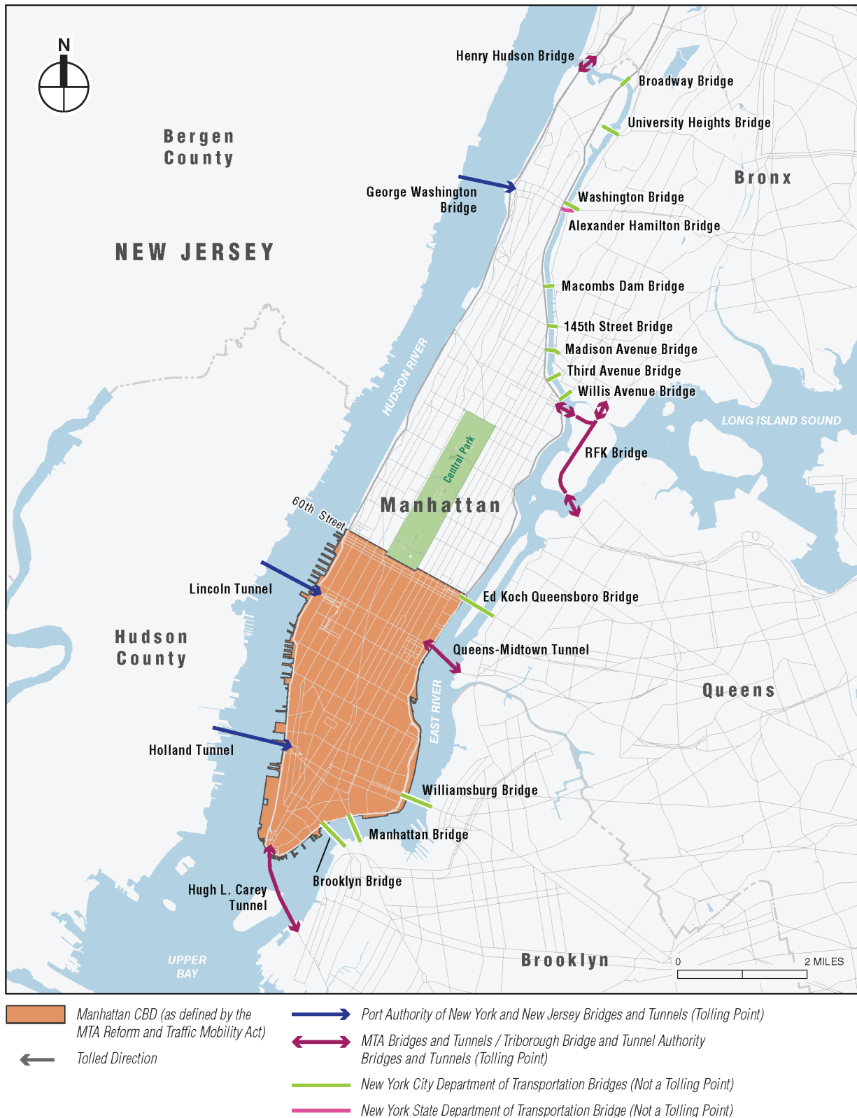
Figure 4-1. Existing Vehicular Crossings to Manhattan