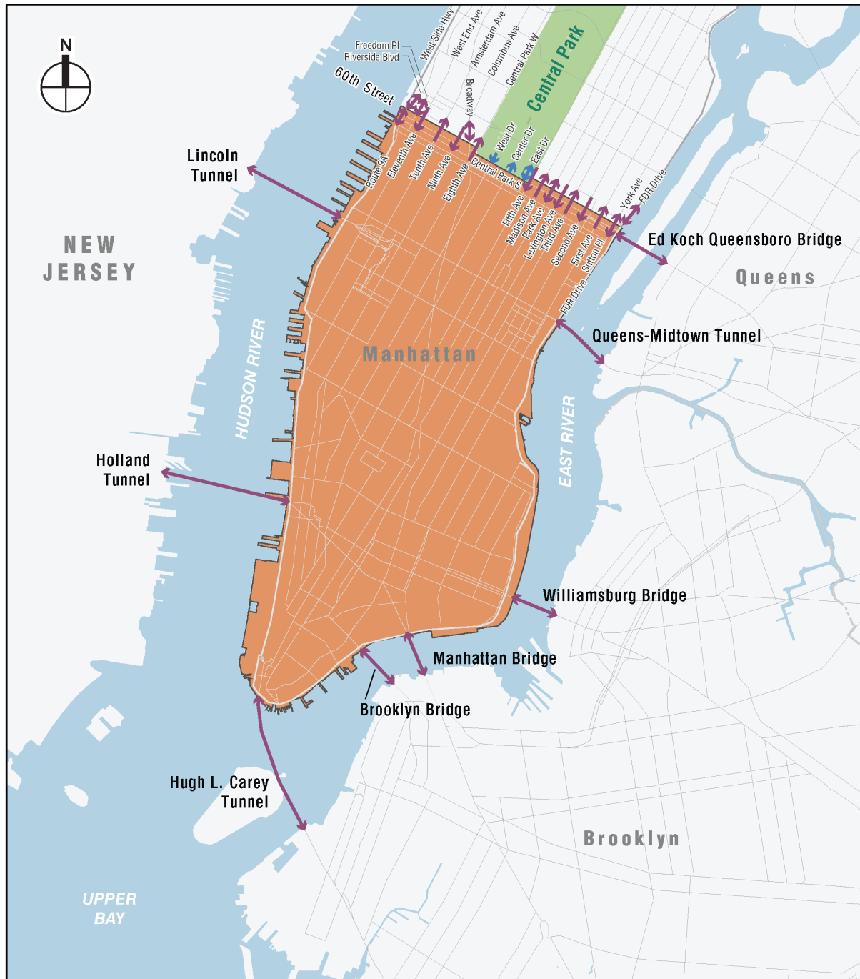
Figure 4-2. Vehicular Entry and Exit Points for the Manhattan CBD