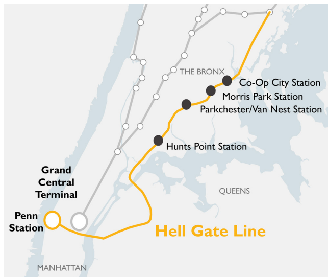
Above: Map of Penn Station Access Project corridor in relation to existing Metro-North network

The project will use Amtrak's existing Hell Gate Line to access Penn Station, maximizing the potential of existing infrastructure, while minimizing impacts on the surrounding community. It will bring the Hell Gate Line into a state of good repair, improving reliability and on-time performance for intercity passengers.