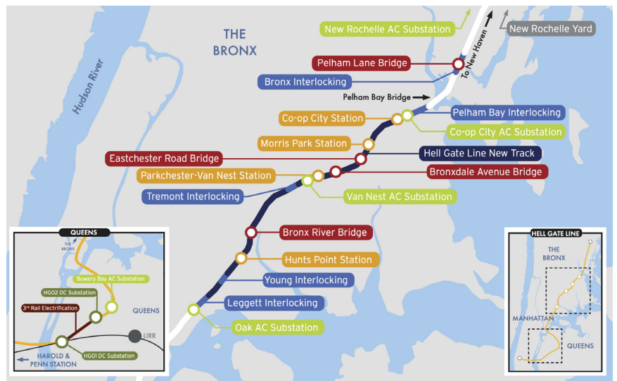
Above: Map of Penn Station Access Project elements, including 19 miles of track work, 4 bridge rehabilitations, 4 new interlockings, 1 reconfigured interlocking, and 5 new and 2 upgraded substations.