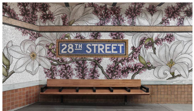
Nancy Blum, ROAMING UNDERFOOT , 2018, glass mosaic, 28 St Station, NYCT