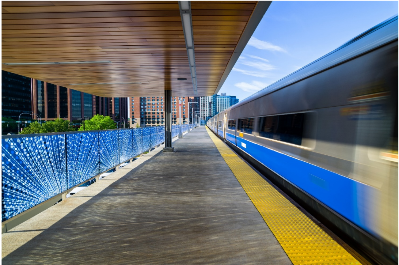
Blue Rails (White Plains) (2020) © Barbara Takenaga, MNR White Plains Station. Commissioned by MTA Arts & Design.

Blue Rails (White Plains) , the artwork in laminated glass, is located on the side platform overlooking the station's parking lot and Hamilton Avenue, a main artery connecting the city's downtown. The long horizontal image is composed of a series of mirrored abstract patterns in a forward and backward movement in space. Each composition is anchored by the radiating light from a misty horizon suggesting the white mist and the disappearing tracks as they move away from the station. Animated by shifting light throughout the day, Blue Rails (White Plains) is a visual play to the "rhythm of the rails".