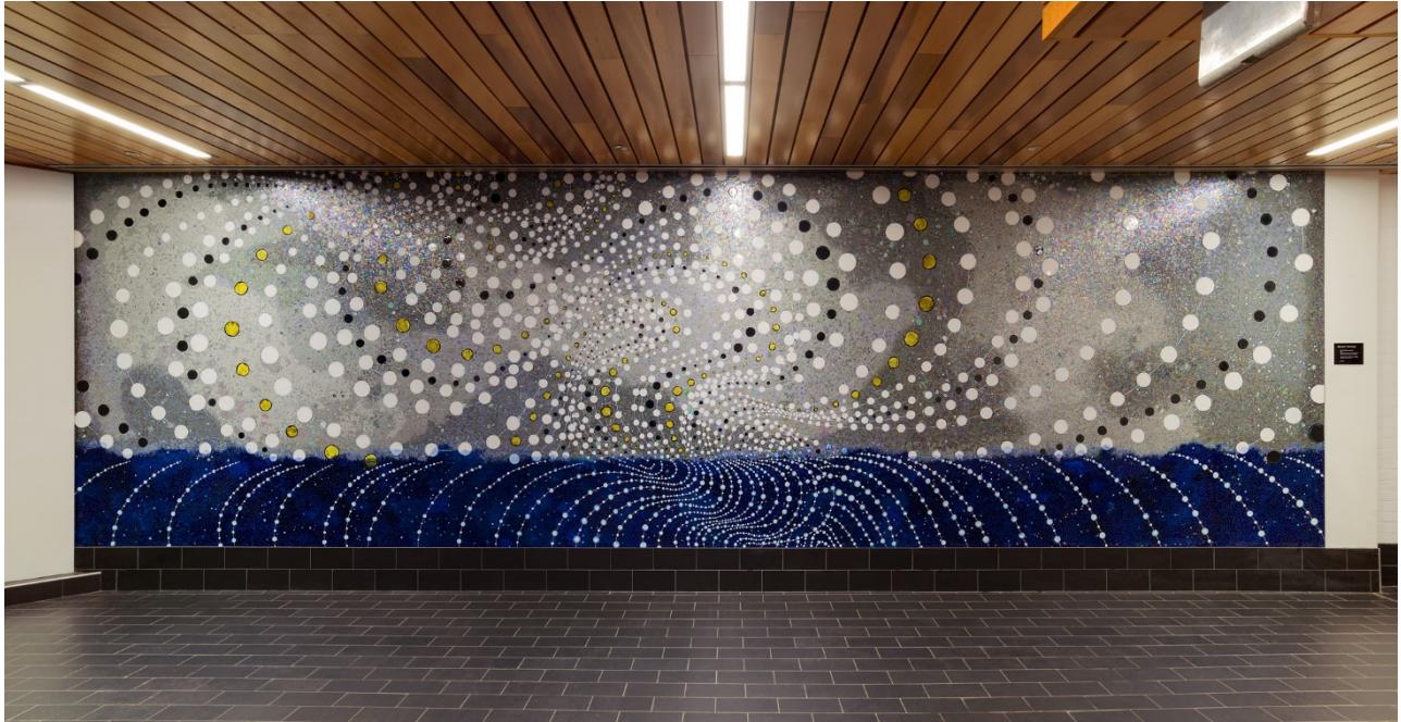
Forte (Quarropas) (2020) © Barbara Takenaga, MNR White Plains Station. Commissioned by MTA Arts & Design.

(NEW YORK, NY — November 1, 2021) MTA Arts & Design is pleased to announce new artwork for the Metro-North Railroad station in White Plains. The mosaic and laminated glass work by celebrated artist Barbara Takenaga for the White Plains Station features the artist's signature stylized abstract forms. The piece's deep vibrant blue undulating movement references rail travel, the history of the city, and its exuberant energy.