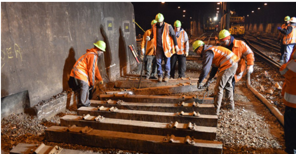
Even without all the work we have planned for the summer, our crews have had a busy 2015.