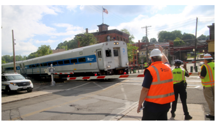
initiative to promote safe behaviors at or around grade crossings.

On Thursday, June 6, Metro-North's Hudson Avenue grade crossing at Peekskill Station, one of the busiest along our territory, was one of seven sites to participate in International Level Crossing Awareness Day (ILCAD), a global