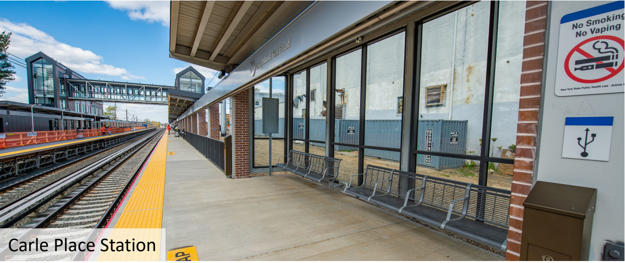
Carle Place Station