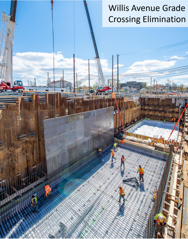
Willis Avenue Grade Crossing Elimination