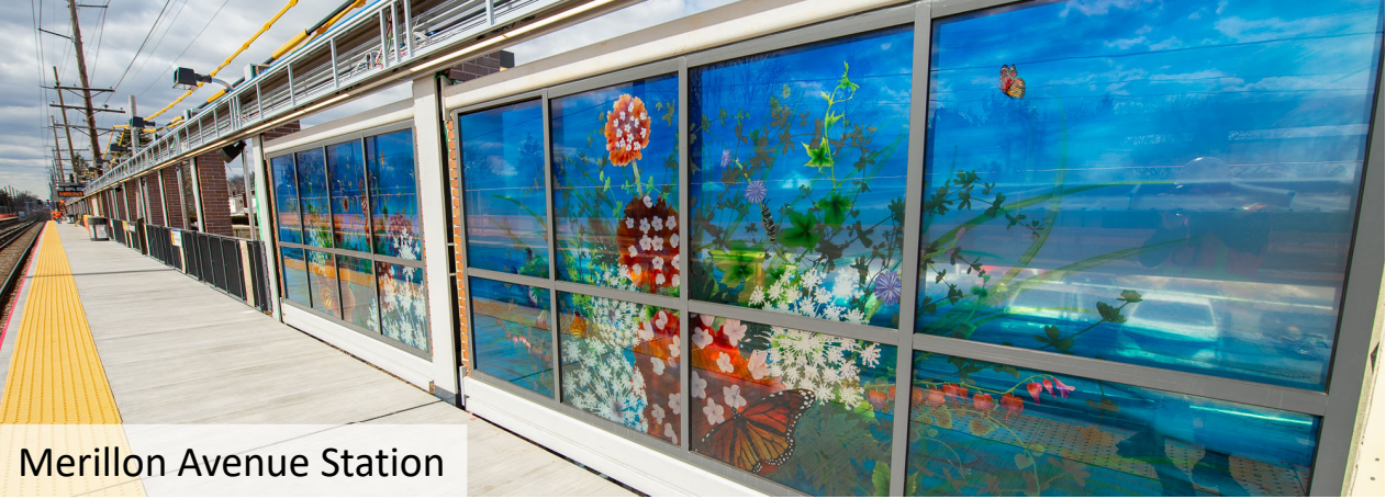
Merillon Avenue Station