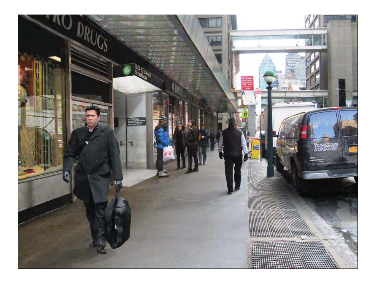
Figure 12-3: Rendering of New Mid-Block Entrance in the Imperial House Apartments Building