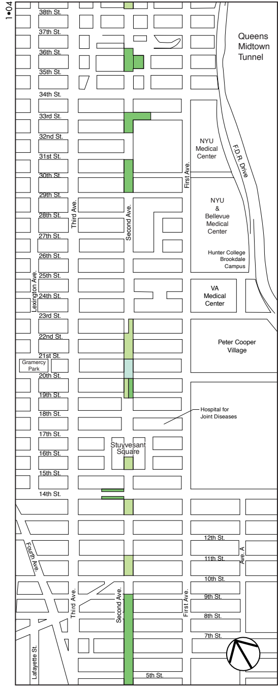
Areas Where Archaeological Resources May Be Present