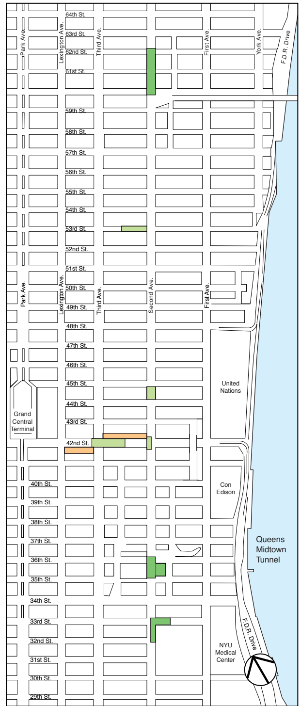
Locations Where Project Would Affect Archaeological Resources If Present