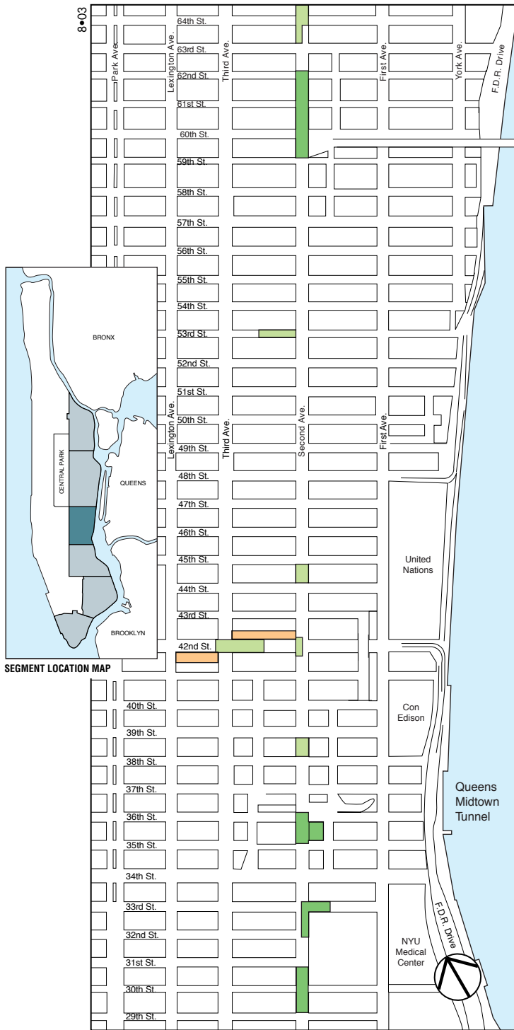
Areas Where Archaeological Resources May Be Present