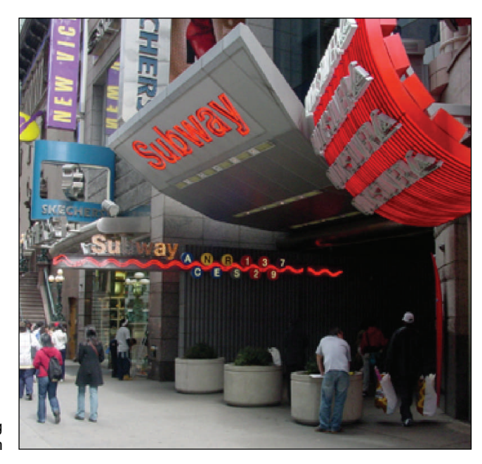
Illustration of an existing off-street entrance to the subway system

Traditional sidewalk entrance not under consideration for the Second Avenue Subway project