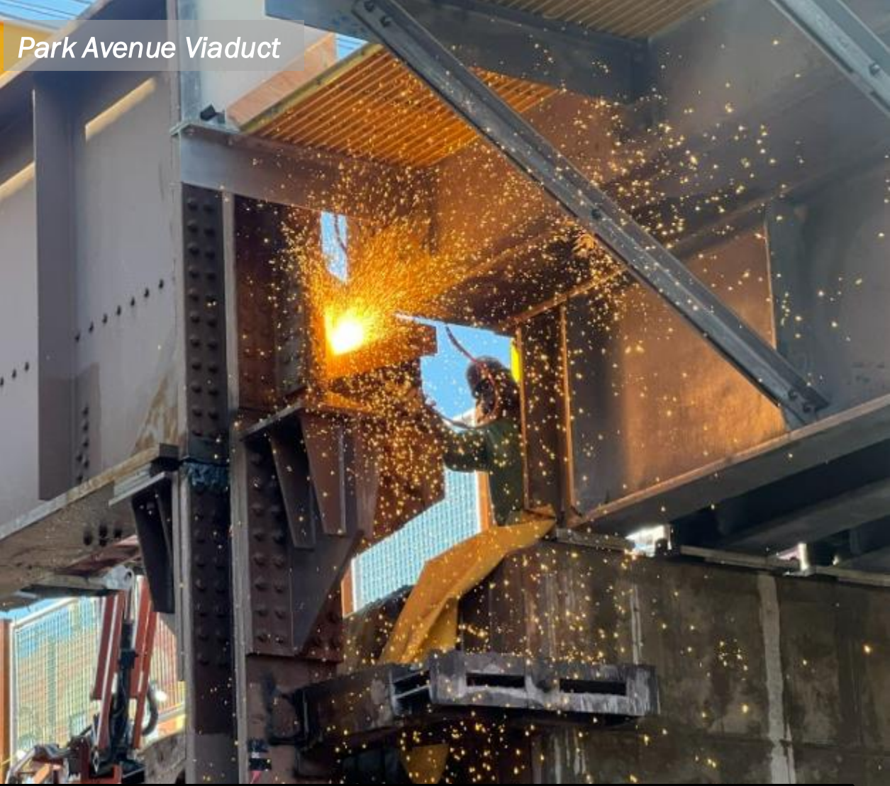
Park Avenue Viaduct