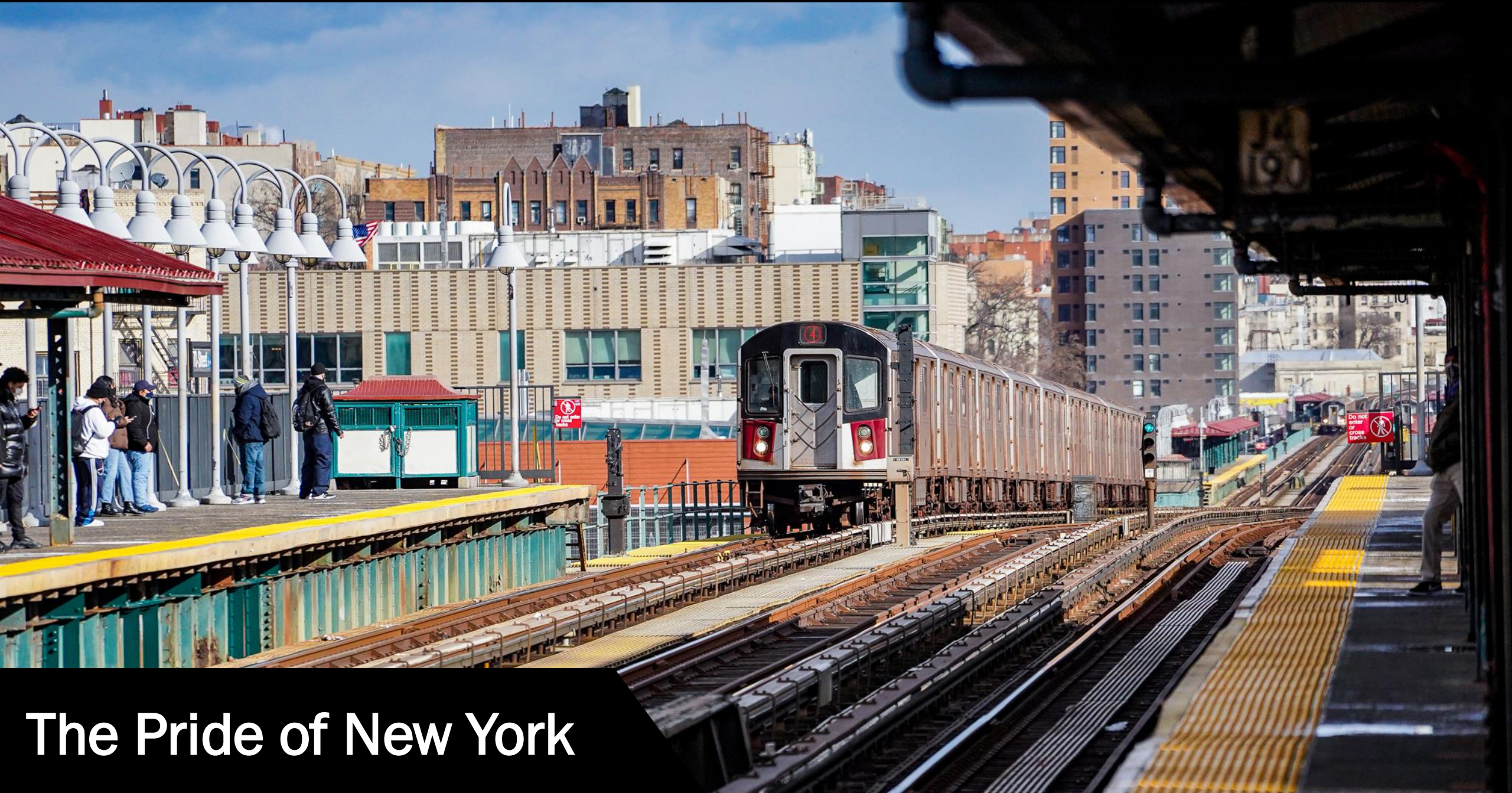
The Pride of New York