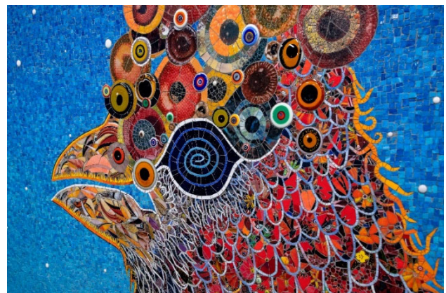
Detail: Wild Things (2024) © Fred Tomaselli, NYCT 14 St-7Av Station. Commissioned by MTA Arts & Design.

Wild Things is Tomaselli's first mosaic project, as well as his first permanent public artwork in Manhattan. His signature style of mixed-media painting has been translated into the new medium by Mayer of Munich, employing a variety of fabrication techniques to capture the artist's original collaged and painted images in glass and ceramic mosaic. The intricate compositions are composed of vibrant traditional smalti, custom-made buttons, and printed glass in a collage-like manner. In addition to depictions by his own hand, the artist typically includes newsprint as a collage