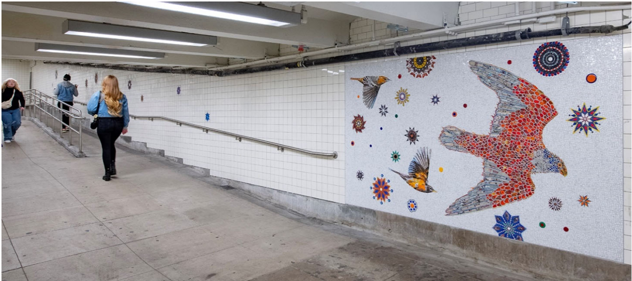
Wild Things (2024) © Fred Tomaselli, NYCT 14 St-7Av Station Passageway. Commissioned by MTA Arts & Design.

material, evident in the Ben-Day dots style printed glass seen on the cardinal image and rays infiltrating the cloud. The stunning new artwork adds more than 680 square feet of mosaic throughout the complex.