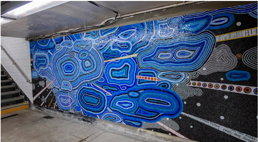
Wild Things (2024) © Fred Tomaselli, NYCT 14 St-6Av Station. Commissioned by MTA Arts & Design.

The mosaics can be found in the 14 St-7Av (1,2,3) station at the stairs to Uptown and Downtown platforms, in the 14 St-6 Av (F,M,L) station Uptown & Queens mezzanine, and in the passage connecting to 6 Av alongside the recently renovated ramp. These and other ADA accessibility upgrades for the station complex are expected to be completed later this year.