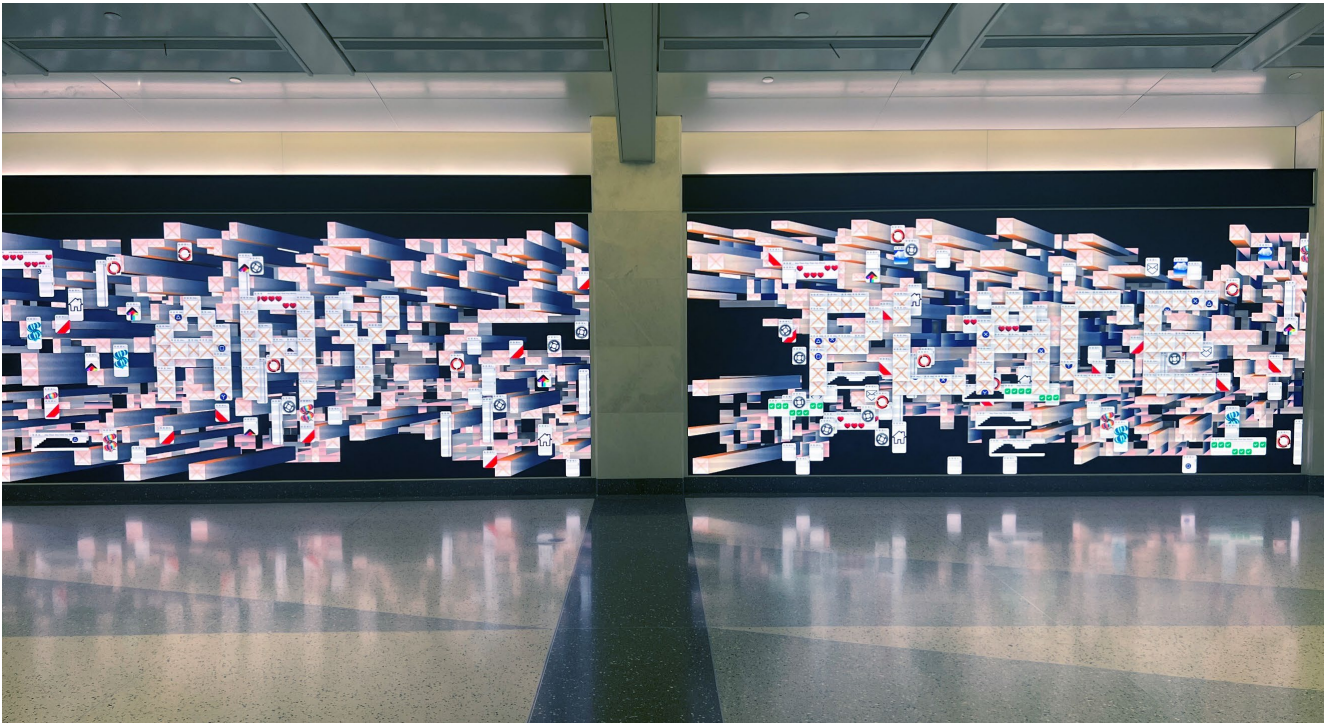
Installation view, Anyplace, Anytime, Anywhere (2024) © Yehwan Song, LIRR Grand Central Madison. Commissioned by MTA Arts & Design.

These artworks are presented as part of the MTA Arts & Design Digital Art Program , which invites artists working in digital media to propose an artwork for temporary exhibition at Grand Central Madison and Fulton Center in Lower Manhattan. This is the third cohort of artists to present their digital work in Grand Central Madison, which opened in January 2023. The new digital artworks are presented alongside highlights of Arts & Design's Long Island Rail Road projects, Poetry in Motion, and additional Long Island Rail Road content.