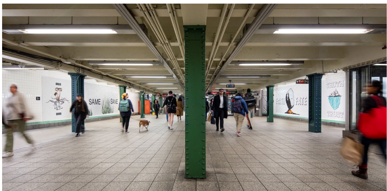
Signs of Life (2024) © Jackie Chang, NYCT Metropolitan Av Station. Commissioned by MTA Arts & Design.

In addition to the two new compositions, two existing panels featuring waves and the words "MANKIND" and "ITSELF" were refabricated and relocated to the Metropolitan Avenue mezzanine on the G line. The threads of messages in Signs of Life can now be experienced in its totality as the commuters rush through the passage of life.