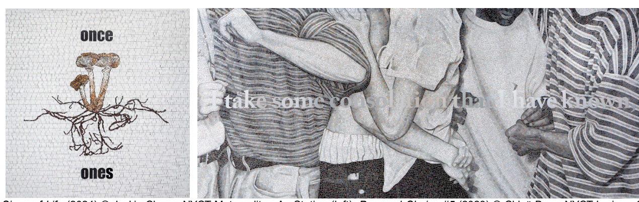
Signs of Life (2024) © Jackie Chang, NYCT Metropolitan Av Station (left). Personal Choice #5 (2023) © Chloë Bass, NYCT Lorimer St Station (right). Commissioned by MTA Arts & Design.

(NEW YORK, NY — June 13, 2024) MTA Arts & Design is pleased to announce two mosaic artworks by artists Jackie Chang and Chloë Bass at the Metropolitan Av/Lorimer St (G,L) station complex in Brooklyn. At Metropolitan Av, Jackie Chang expanded upon Signs of Life, originally installed in 2000, and created two new compositions featuring graphic symbols and bold text that spark contemplation for those traveling through the station. At Lorimer St, Chloë Bass' artwork, titled Personal Choice #5, consists of three compositions portraying various gestures of touch overlaid with text written by the artist, lending a sense of continuity across each wall. Both artworks were fabricated by Miotto Mosaic Art Studios and are integrated with the ADA accessibility upgrades for the station complex, which was completed in March 2024, including new elevators, stairs and other improvements.