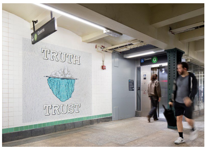
Signs of Life (2024) © Jackie Chang, NYCT Metropolitan Av Station. Commissioned by MTA Arts & Design.

For the project, Chang created two new compositions to accompany her existing artwork for the station complex. The new artwork, bearing the same title as Signs of Life, juxtaposes seemingly unrelated words in marble cutout and graphic symbols in glass mosaic. One panel features the text "TRUTH" and "TRUST" with the image of an iceberg. The other depicts "ones" and "once" with an image of an Armillaria fungi, among one of the world's largest and oldest organisms. The artwork by Chang is an intriguing interplay between graphic symbol and text. For Chang, a single