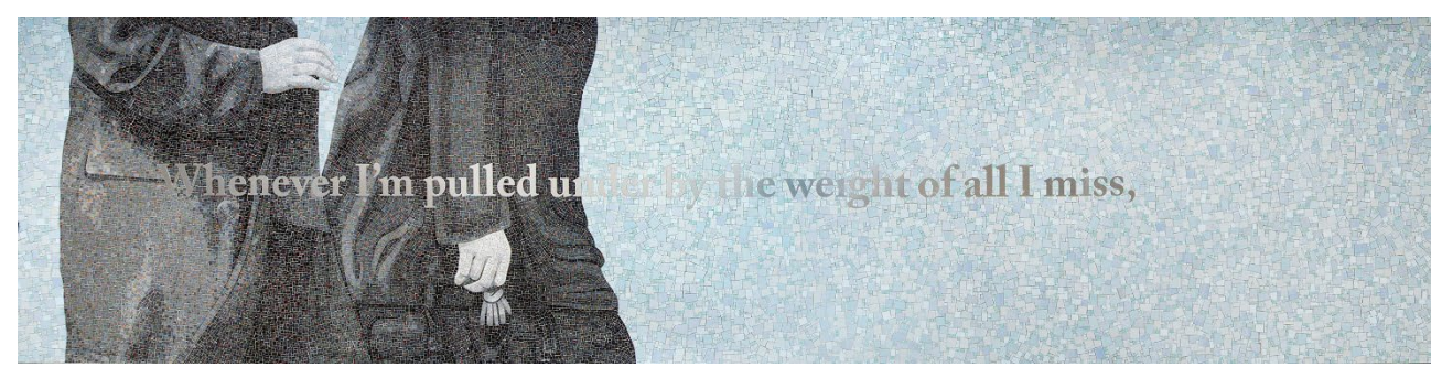
Personal Choice #5 (2023) © Chloë Bass, NYCT Lorimer St Station. Commissioned by MTA Arts & Design.

Located at the newly reconfigured control area at the Lorimer Street on the L, Personal Choice #5 by Chloë Bass invites riders to reflect on lived communal experience, connection, and proximity in New York City. The artwork is part of an ongoing series titled Personal Choice , a text and image-based project that pairs cropped found images sourced from the New York Public Library's Picture Collection with poetic text written by Bass.