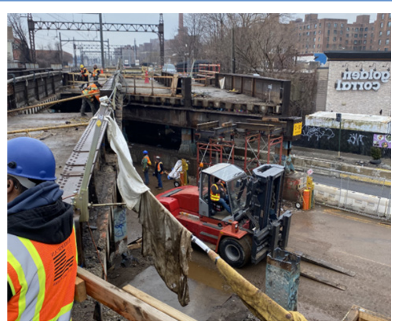
Crews work on the demolition of half of the existing bridge at Bronxdale Avenue Bridge. February 2024.

As summer approaches, rehabilitation work will continue to take center stage at Bronxdale Avenue Bridge. Half of the existing bridge has been removed in preparation for the construction of half of the new bridge structure, which will carry two new tracks. Construction on the Pelham Lane Bridge is underway and partial demolition of the existing bridge will take place later this year. At Bronx River Bridge, work is underway to prepare the existing abutments and pier for the new bridge installation scheduled for later this year. From replacing caissons to installing new columns, work on the catenary structures at the Co-op City substation will move forward in the coming months. At Leggett Interlocking, construction of new tracks and supporting infrastructure will begin, including retaining wall construction and installation of a new drainage system.