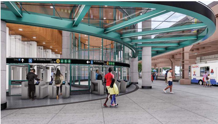
125th Street Entrance 3 at Park Avenue

Phase 2 of the Second Avenue Subway will further reduce congestion on the 4, 5, and 6 lines by drawing an expected 100,000 daily riders, transporting East Harlem and Bronx riders with faster commutes, fewer delays, greater reliability, and more connectivity to subway and regional transit.