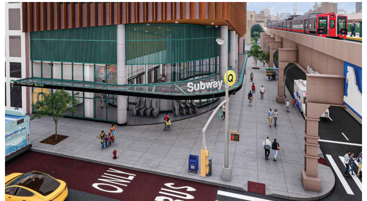
Entrance 3 at 125th Street proximate to Metro-North Railroad