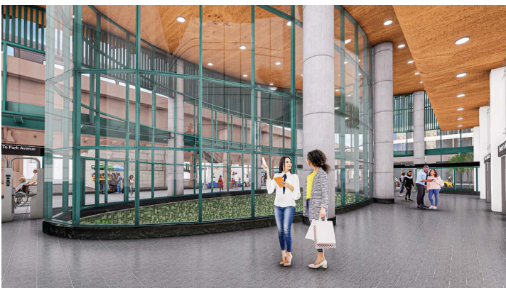
Interior of Entrance 3 at Park Avenue