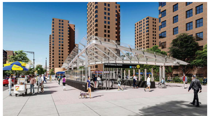
106th Street Entrance 1