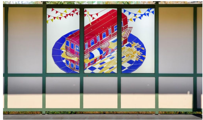
Olalekan Jeyifous, Made With Love , 2019, glass, NYCT 8 Av Station (N), Brooklyn