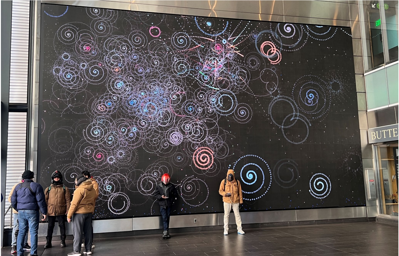
Infinite Orbits (2023) © Carter Hodgkin, NYC Transit Fulton Center. Commissioned by MTA Arts & Design.

(NEW YORK, NY — December 28, 2023) MTA Arts & Design is pleased to announce Infinite Orbits , a new digital artwork by New York-based artist Carter Hodgkin, is now on view at the Fulton Transit Center in Lower Manhattan. Infinite Orbits is an abstract visualization of energy. The coding-derived animations transform the complex into a fleeting, immersive environment. Colorful swirls dance across the 52 screens throughout Fulton Center and the Dey Street pedestrian tunnel, connecting multiple New York City Transit lines and the World Trade Center PATH station. The digital artwork is displayed for two minutes at the top of every hour.