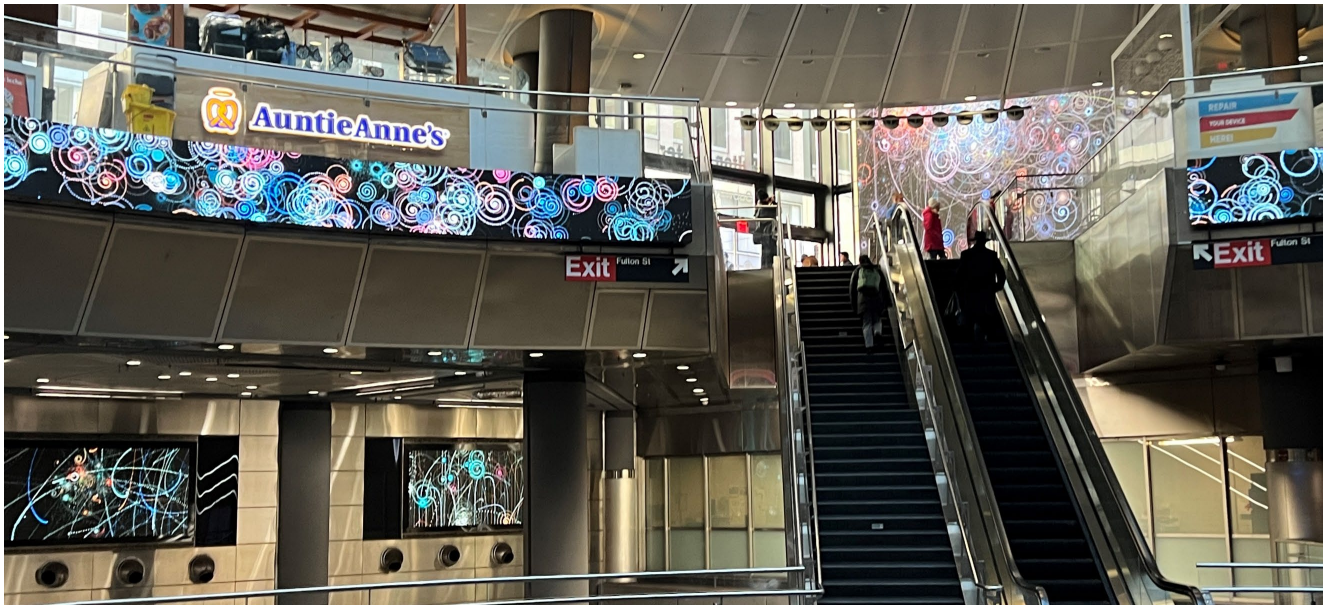
Infinite Orbits (2023) © Carter Hodgkin, NYC Transit Fulton Center. Commissioned by MTA Arts & Design.