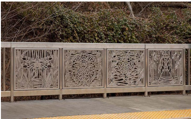
Everet, A Portrayal of Life at Mill Creek , 2018, stainless steel, Richmond Valley Station, SIR

MTA Arts & Design seeks images of artists' previous work to review in consideration for a new permanent Percent for Art project, in conjunction with renovation of Huguenot Station in Staten Island. An approved fabricator will translate the final artwork designs into a durable medium. The artwork is projected to be realized in metal. An artist's prior experience with this material will not be taken into consideration when reviewing images.