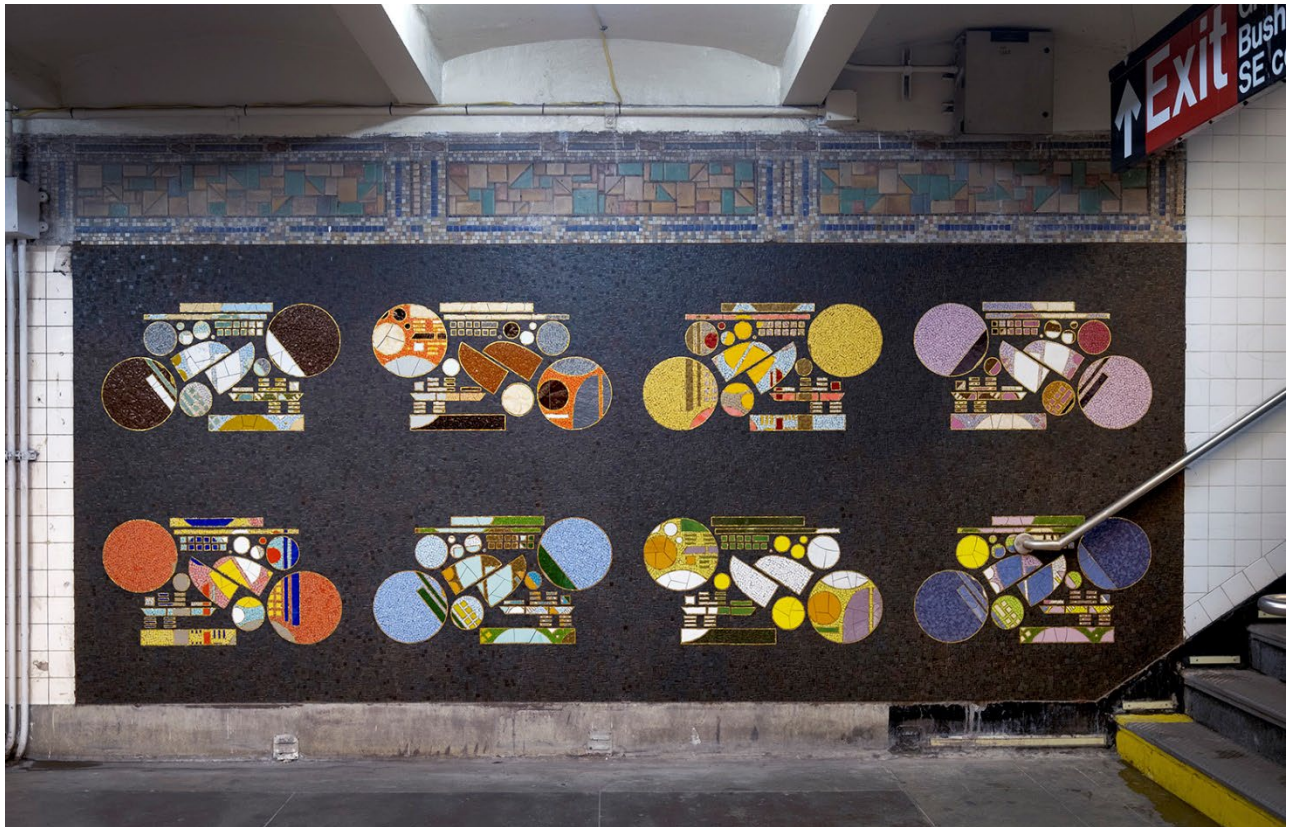
Gratitudes off Grand (2023) © Glendalys Medina, NYCT Grand Street Station. Commissioned by MTA Arts & Design.

(NEW YORK, NY — August 31, 2023) MTA Arts & Design announces a dynamic new mosaic artwork commission by artist Glendalys Medina for the Grand Street (L) station in Brooklyn. Two panels, one on each platform mezzanine, comprise Gratitudes off Grand . The installation totals around 340 square feet of glass mosaic fabricated and installed by Miotto Mosaic Art Studios, including a 40-foot-wide panel on the Brooklyn-bound side. The Grand Street station is receiving ADA accessibility upgrades, including new elevators, completed this month, and other improvements.