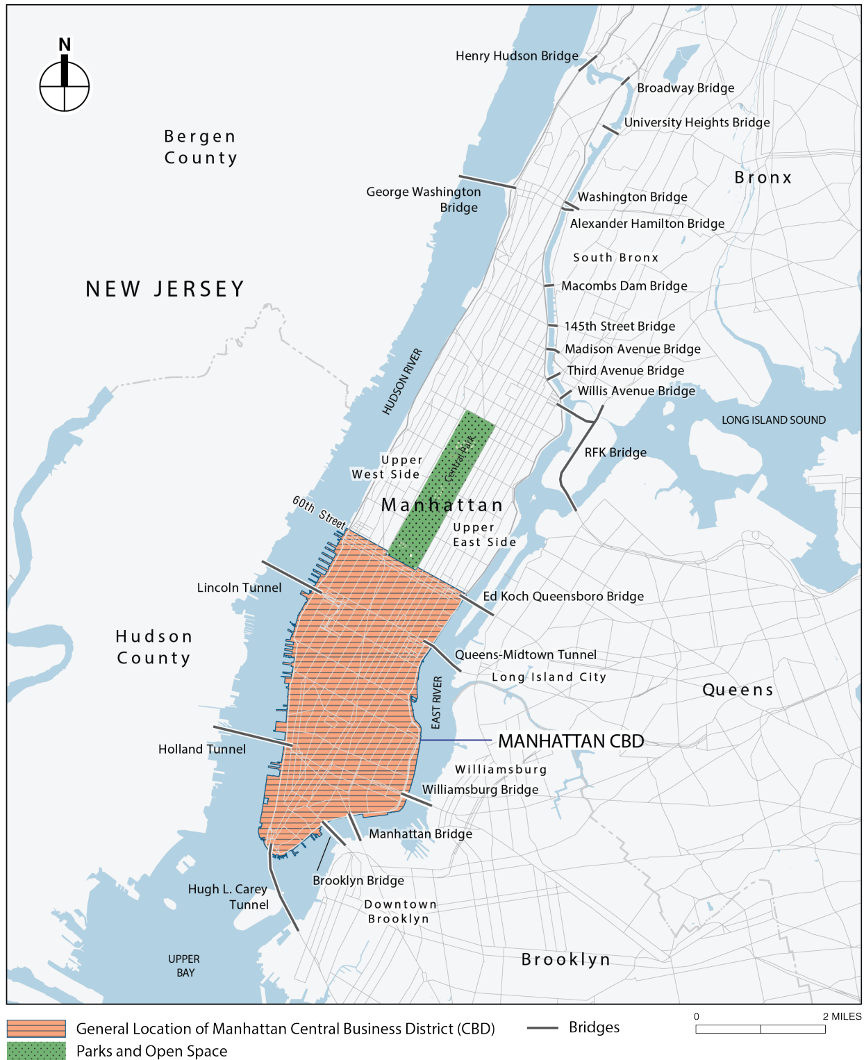
Figure 4D-2. General Location of Neighborhoods Near the Manhattan Central Business District

Note: The MTA Reform and Traffic Mobility Act defines the Manhattan CBD as the area south of and inclusive of 60th Street but excluding the West Side Highway/Route 9A and the FDR Drive