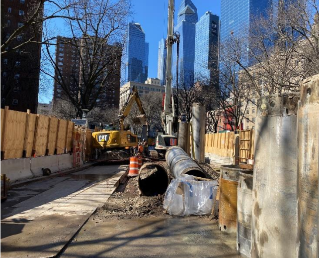
Main work zone -Secant pile installation