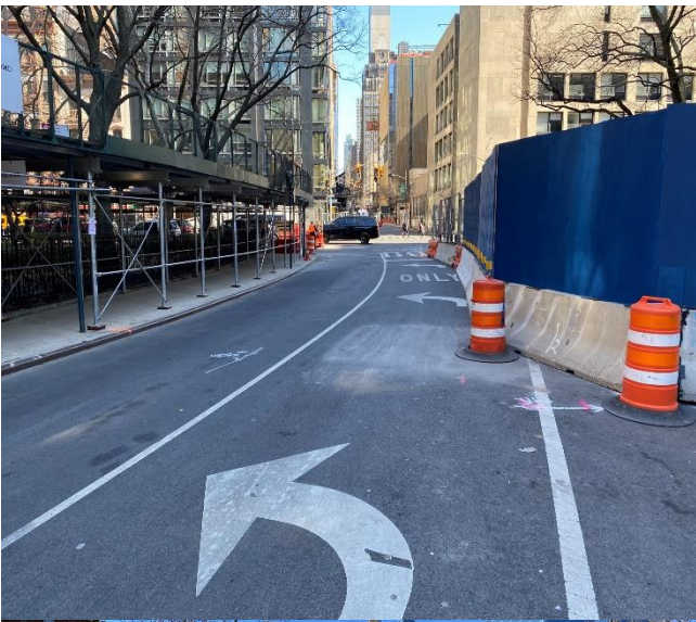
Northern parking lane open for traffic