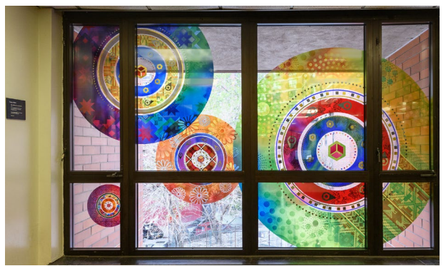
Tomo Mori, The Wheels on the Bus , 2018, laminated glass, Manhattanville Bus Depot, NYCT